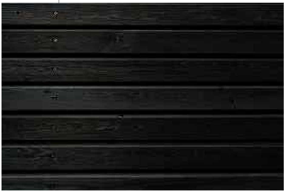
EXAMPLE SHIP LAP CLADDING